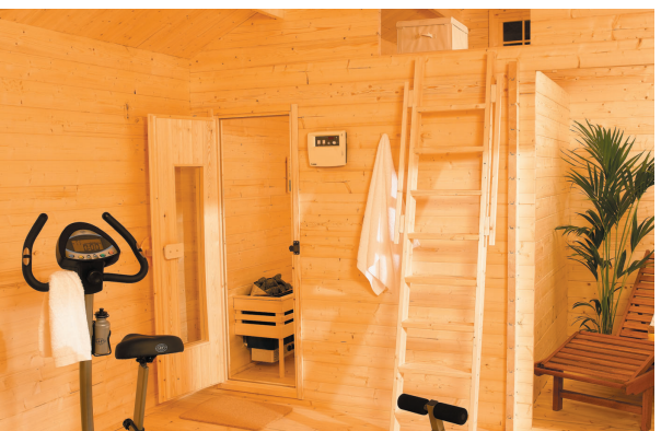
Main room showing door into sauna and loft access.